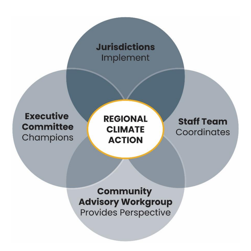
Figure 1. TCMC Collaborative Structure.